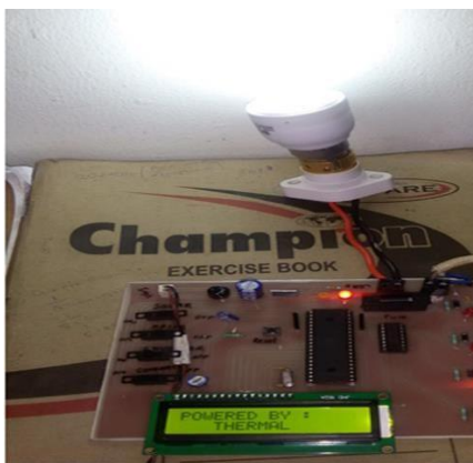
Fig:3 Experimental Model

In addition to using traditional compiler tool chains, the Arduino project provides an integrated development environment (IDE) based on the Processing language project. The Arduino project started in 2005 as a program for students at the Interaction Design Institute Ivrea in Ivrea, Italy,[2] aiming to provide a low-cost and easy way for novices and professionals to create devices that interact with their environment using sensors and actuators. Common