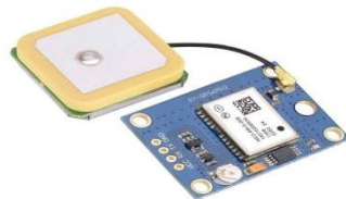
Figure 4: GPS Module

The Global Positioning System is a location tracker. It tracks the current location in the form of longitude and latitude. The GPS Coder Module will use this information to search an exact address of that location as the street name, nearby junction etc. which is directly connected to USART of the microcontroller provides reliable positioning, navigation, and timing services to worldwide users on a continuous basis in all weather, day and night, anywhere on or near the Earth. . In case if GPS is disabled then the system will only send the longitude and latitude through SMS. So, Internet is mandatory.