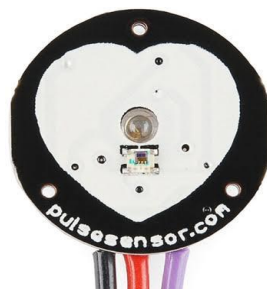
Figure 8: Pulse sensor

It is an RTD(Resistance Temperature Detector) or a thermocouple, that collects the data about temperature from a particular source and converts the data into understandable form for a device or an observer. In this system it senses the body temperature of a person who wears it.