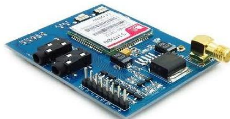
Figure 5: GSM module

GSM module is used to establish communication between a computer and a GSM-GPRS system. Global System for Mobile Communication(GSM) SIM card is inserted within the mobile device to send and receive the messages