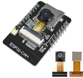
Figure 6: ESP32-CAM

IoTModule(ESP32-CAM) The Internet of things(IoT) has evolved due to convergence of multiple technologies,real-time analytics, machine learning, commodity sensors, and embedded systems the physical world into computer-based systems, and resulting in improved efficiency, accuracy and economic benefit.IoT is that the network of the physical devices, vehicles, buildings and alternative things embedded with physics, software, sensors, actuators and network property that modify to gather and exchange information.TheIoT allows objects to be sensed and controlled remotely across existing network infrastructure, creating opportunities for more direct integration. Camera incorporated in this system is used to capture the culprit, it is 5 megapixel camera