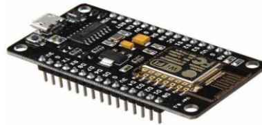
Figure 3: Node MCU(ESP8266)

The block diagram consists of the following blocks. Battery 12v rechargeable battery is used to power the circuit. Node MCU is the low cost open source IoT platform. Node MCU (ESP8266) is a microcontroller board. Node MCU provides access to the GPIO (General Purpose Input/Output) pins. It consists of 30 input/output pins, 2 UART pins, a 40 MHz crystal oscillator, a USB connection, a power jack, an ICSP header, and a reset button. It contains everything that needs to support the microcontroller.