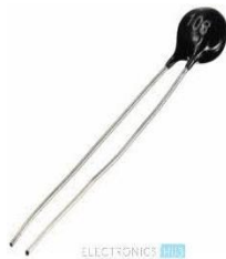
Figure 7: Temperature sensor

It is an RTD(Resistance Temperature Detector) or a thermocouple, that collects the data about temperature from a particular source and converts the data into understandable form for a device or an observer. In this system it senses the body temperature of a person who wears it.