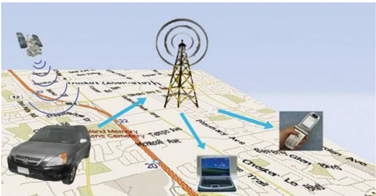
Figure 2: GPS module

GPS stands for Global Positioning System .GPS receivers received the signal from the space and provide all the coordinates properly which helps in determining the exact location of the vehicle in very less time. GPS provide exact location continuously in all type of whether condition, 24×7 and on each part of the earth. We used SR86 GPS modem in our project. State of reception of GPS depends upon the strength of the GPS signal. The greater the signal strength is , more stable the reception status is.GPS receiver contain antenna with pre amplifier and also a RF section with signal identification.