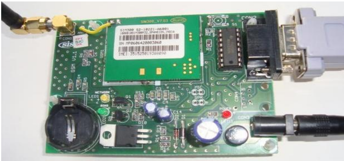
Figure 1: GSM Module