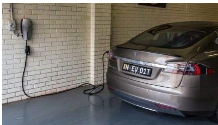
(Fig.2: An EV charging at home)

According to Wikipedia, an electric car is around three times as efficient as cars with an internal combustion engine. Also according to Cleantechnica, which is an EV based news website, stated “EVs convert about 59%–62% of the electrical energy from the grid to power at the wheels. Conventional gasoline vehicles only convert about 17%–21% of the energy stored in gasoline to power at the wheels” [6]. Moreover, gas prices are at its peak, especially in India where the price of petrol is $4.1 per gallon. Since electric vehicles don't require any fuel or gas to power it, a user can escape the steep rise in prices of these commodities. All they need is to charge their vehicles from charging station which is way cheaper. It can be even more beneficial as one can setup the charger at home. This will save a lot of time as one can put the car in charge while doing other work. Also unlike public chargers, there won't be any direct profit involved in charging through home making it to save even more bucks. It won't be possible to setup gas dispenser machine at home though.