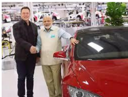
(Fig.11 Narendra Modi at Tesla Headquarter in 2015)

Our present Prime Minister, Narendra Modi even visited to Tesla, which is no. 1 electric car manufacturer in Fremont, CA to experience it and talked to Elon Musk, Tesla's founder for future India plans. Even Nitin Gadkari, Minister of Road Transport and Highways of India talked to Elon Musk for future EV support.