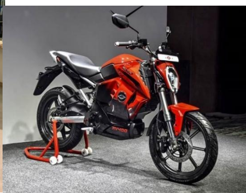
(Fig.8 Revolt RV400)

Coming to cars, truly speaking there is no pure electric car that can be considered buyable right now. However, there exist some 4-5 hybrids cars but have least popularity and some of them like Toyota Prius is discontinued because of having almost zero demand. Reason is simple. The battery technology, charging network and the whole mechanism is not developed yet to build a successful electric car. And that's why there is no such awareness about it and people are not getting any purpose of buying it. For example, the only brand that offers electric car is Mahindra. Its one electric car is eVerito which is the electric version of Verito model. The electric version cost double the price from regular Verito and that too offering much low range, charging network limitations and even some features are missing out. Why one would buy such EVs?