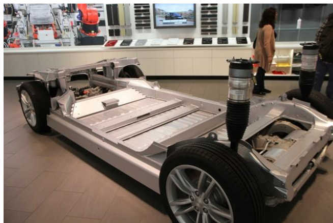
(Fig.3 EV's battery sealed flat at bottom)

Moreover, the batteries are packed and sealed tightly in a way that there is very less chance to catch fire which is not the case with ICE cars that can easily catch fire due to its inflammable fuel. And even if EV catches fire, it will ignite slowly creating an easy chance for passenger to escape while the ICE vehicle will burst out in seconds giving very little possibility for the passenger to escape.