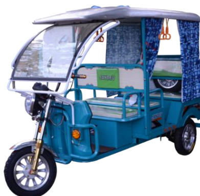
(Fig. 10 e-rickshaw)

Another thing becoming more common is electric commercial vehicles. We can commonly see e-rickshaws, which is the electric version of a three wheeler used as public transport. Also companies like Tatamotors and Ashok Leyland have launched e-buses and many cities havestarted using it for public transport.