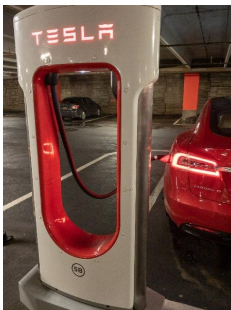
(Fig.5 Electric car charging at charging station)