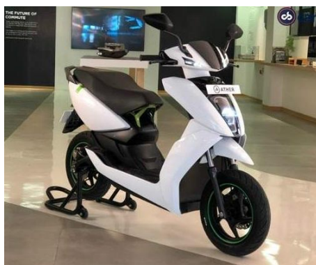
(Fig.7 Ather 450)

For two wheelers, startups are more willingly working than pre-existing manufacturers on electrifying bikes and scooters as an opportunity because two wheeler is the most common way to commute for people. These companies are Ather Energy, Twenty Two Motors, Okinawa Motors etc. for electric scooters and Revolt, Emflux, Tork coming up with their electric bikes. These startups came with really good design and usable technology.