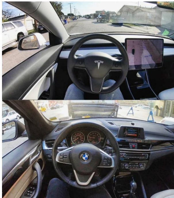
(Fig.4 EV vs ICE interior)