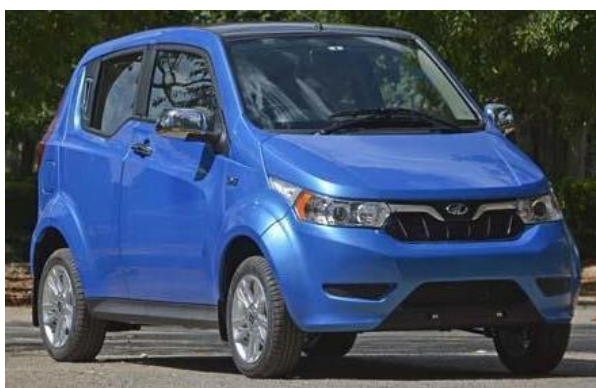
(Fig.6 Mahindra's present EV, e20 plus)