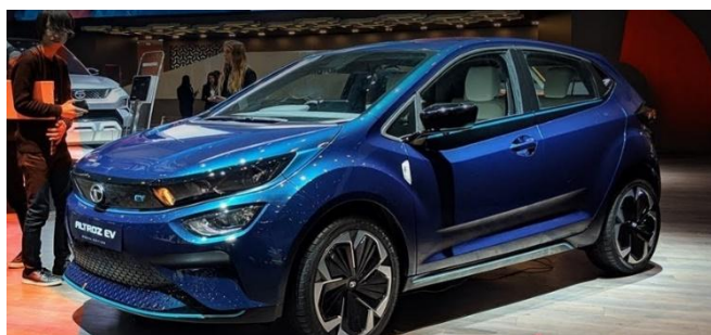
(Fig.9 Tata's upcoming electric car)

However, companies like Tata motors, Hyundai, Mahindra, Kia and Nissan are spending their time to give India an EV future. These companies are working on better technology, charging network and will be launching their competitive electric cars within next 2-3 years.