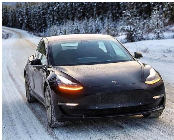
(Fig.1 : Tesla Model 3)

At present, China is the largest EV user by number but if we see by percentage, Norwegian people are most familiar with EV as 31.2% of total car sales last year was EV and the percentage will even increase this year.[1].