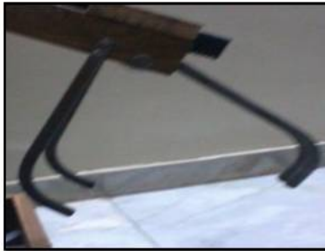
Fig.3. ARM Design – Jaw