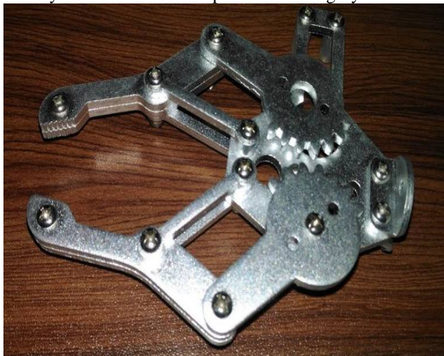
Fig.2. ARM Design – Fingers

Automation as a technology is concerned with the use of mechanical, electrical, electronic and computer-based control systems to replace human beings with machines, not only for physical work but also for the intelligent information processing. Industrial automation, which started in the eighteenth century as fixed automation has transformed into flexible and programmable automation in the last 15 or 20 years. Computer numerically controlled machine tools, transfer and assembly lines are some examples in this category.