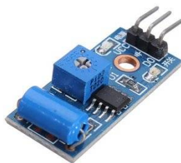
Figure-3 vibration sensor.

The vibration module based on the vibration sensor SW-420 and comparator LM393 to detect if there is any vibration that beyond the threshold. The threshold can be adjusted by the on-board potentiometer. When this no vibration, this module output logic LOW the signal indicate LED light, and vice versa. No shock, vibration switch was closed conduction state, output of low output, the green indicator light. Shock, vibration switch instantly disconnected, the output-side output high, the green light does not shine. The output can be directly connected to the microcontroller to detect high and low, thereby detecting whether the vibration environment, played the role of the police.