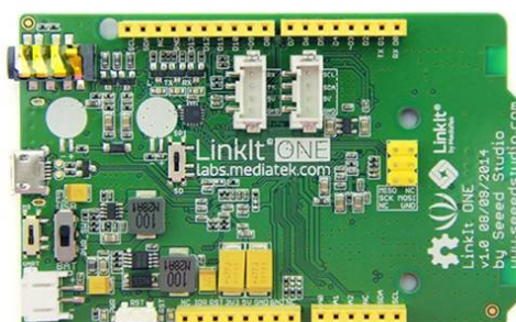
Figure-2 linkit one pinout board

The LinkIt ONE development platform is an open source, high performance board for prototyping Wearables and IoT devices. It is based on the world's leading SoC for Wearables, BMediaTek Aster (MT2502) combined with high performance Wi-Fi (MT5931) and GPS (MT3332) chipsets to provide you with access to all the features of MediaTek LinkIt. It also provides similar pin-out features to Arduino boards, making it easy to connect various sensors, peripherals, and Arduino shields. LinkIt One is an all-in-one prototyping board for IoT/wearables devices. Integrating GSM, GPRS, Wi-Fi, GPS, Bluetooth feature