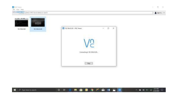
Fig4 VNC Viewer home page

5. Connect the raspberry pi with the viewer using raspberry pi's IP address. 6.Now the viewer is ready for executing the output.