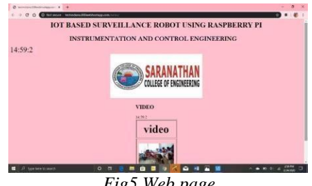
Fig5 Web page

JavaScript. PHP and javascript is used to transmit the video which been captured using the night vision Web camera to the webpage, and the webpage displays the video which is captured using camera when the PIR value goes high when any motion is detected and the same transferred to the webpage via php.