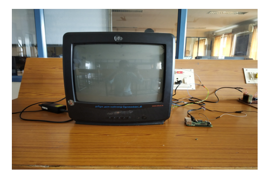
Fig.2 Interfacing with Television