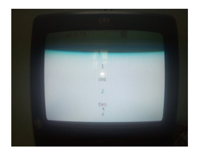
Fig.7 FINAL OUTPUT

The following fig.7, shows the final prototype of proposed project.