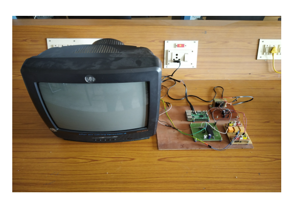
Fig.4 Working Model

It is used to improve physical and mental abilities and physical activities such as cycling, running is improved mental abilities such as problem solving, GK questions are improved. In this technique we provided two modes of switching. In this first mode of switching, television is operated in normal way for a period of time. After a period it will display the different types of questions. Based on the questions, answer should be chosen by using the remote. After completing certain number of questions the television will switch on for some period of time (as required). Then later physical activity is continued, so television is turned off automatically. We prefer cycling to improve physical ability. So he has to do cycling for certain period of time(timing as required). Here we use RF link to exchange data between cycle and Raspberry Pi. When the received time period satisfies the required amount, the television automatically turned on by Raspberry Pi. This process repeated again and again. The overall hardware model is shown in below fig.4