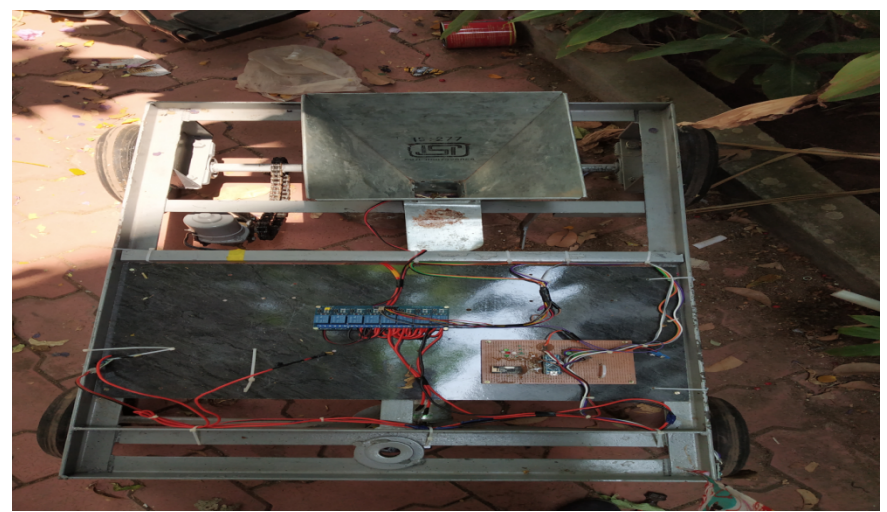
Fig.2 Hardware Implementation

The digging part is used to dig the sand around the tree. Here digging part is designed to dig the soil at the depth of 1.5 inch. Hopper along with actuator controlled opening is fixed at the top of the system is used to pour the fertilizer whenever the system starts to dig. The pouring part starts pouring after the motor stars running. If the motor starts running, the fertilizer starts pouring in the hopper. If the motor stops running, the fertilizer pouring part stops pouring it by the feedback taken in the wiper motor. The mechanical setup fixed at the back of the system used to reclose the soil after the fertilizer is poured.