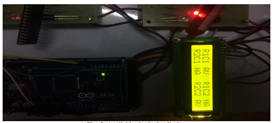
Fig. 3. Available slot in the display