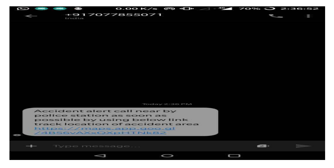
Fig. 3 An SOS message sent to the preinstalled registered number in the car

When the system has been successfully installed in the car, it will generate an SOS like shown, in case of an accident, trying to provide fast and effective medical attention, if required