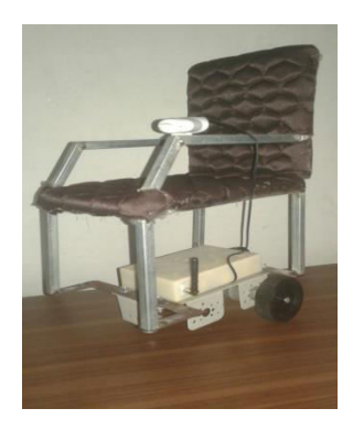
Fig 3.Final Prototype

The proposed system is very much effective than the existing system in many aspects. Proposed system has two ways of controlling the wheelchair and also has an obstacle detecting system. It also has a patient monitoring system in it. In the existing system there is no such speciality. Thus the proposed system is very much helpful and effective in a handicapped person's life and it also will help them to live a colourful life without depending others for their basic needs.