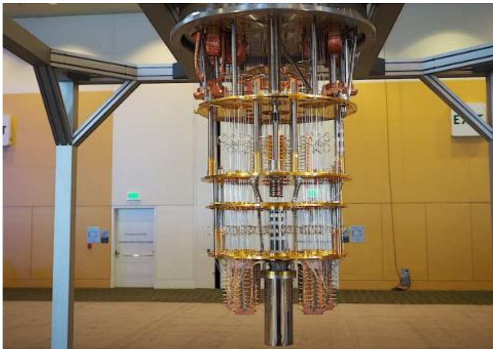
Fig. 2: Quantum computing leaps.

Natural change will likewise affect character. This includes a mind boggling count process and the benefits of quantum computing are completely reflected. The use of quantum likelihood is a more extravagant, more good and bad times of the content, and the result is much increasingly unforeseen. Moreover, as a specialist in the reproduction business, they said that the investigation of quantum computing will assume an explicit job in the foundation of a military reenactment system. Its exceptional computing capacity and capacity limit will infuse new imperativeness into military simulations in technique age, fight harm evaluation and different perspectives. At this stage, the precision of counts and the security of information transmission are guaranteed. Consistent enhancement of quantum algorithms can make the methods for reproduction more advanced and the outcomes progressively dependable, eventually accomplishing the motivation behind exact, down to earth, and imagined simulation information, photovoltaic, power supplies, new materials, pharmaceuticals, and pharmaceuticals. Super conductivity Quantum algorithm examine, while advancing the improvement of quantum computers and the arrival of quantum cloud stages. It can likewise keep on spreading to more fields and assumes a significant job[11]. This article primarily talks about a few parts of the computer field, including AI, quantum mindfulness, imaginative age, military simulation, etc.