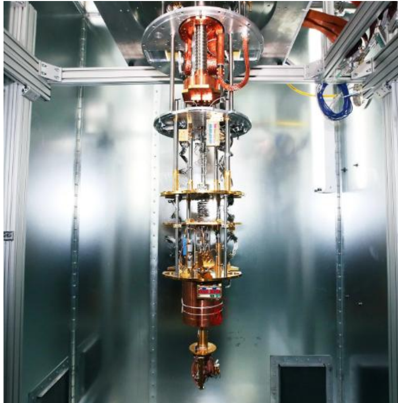
Fig. 1: Google's quantum supremacy.

invigorate feelings (Fig. 1). The procedure includes the expansion of complex feelings and passionate computing[6], [7].