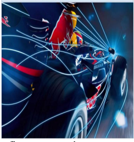
fig a. secret image

The performance of the proposed system results are analyzed by simulating the target and secret image in MATLAB. The inputs are the target and secret image.