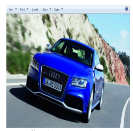
fig b.target image

Fig a. shows the input secret image that is used for analyzing the performance of the proposed system. The secret image is of the JPEG format and it is in RGB color space. Fig b. shows the input target image in which the secret image shown in fig4.1. is to be hided. Target image is used as the base image in which the secret images to be hided. The target image chosen arbitrarily i.e. the user can chose an image based on his/her interest. As the secret image, the target image is also in RGB format with JPEG compression standard. The RGB color model is an additive color model in which red, green, and blue light are added together in various ways to reproduce a broad array of colors.