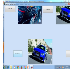
Fig c.Resized target image

Fig a. shows the input secret image that is used for analyzing the performance of the proposed system. The secret image is of the JPEG format and it is in RGB color space. Fig b. shows the input target image in which the secret image shown in fig4.1. is to be hided. Target image is used as the base image in which the secret images to be hided. The target image chosen arbitrarily i.e. the user can chose an image based on his/her interest. As the secret image, the target image is also in RGB format with JPEG compression standard. The RGB color model is an additive color model in which red, green, and blue light are added together in various ways to reproduce a broad array of colors.