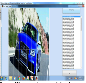
Fig e. Target image blocks