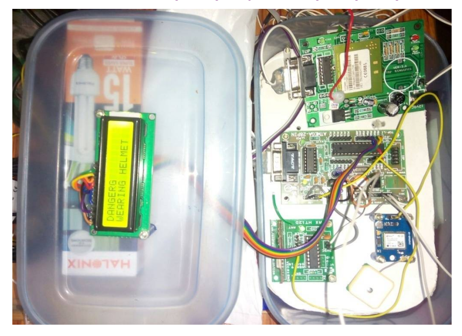
Fig 3 Device indicating the rider to wear helmet

Department of Electronics & Instrumentation Engineering, Adhiyamaan College of Engineering, Hosur, Tamilnadu, India