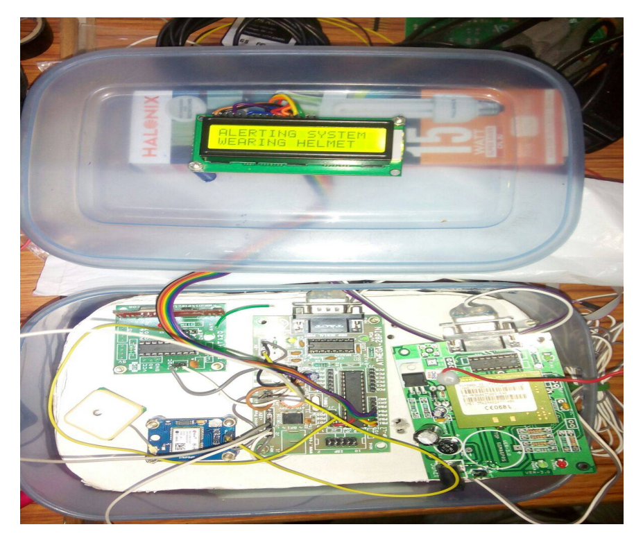
Fig 2 Experimental setup showing the working of alert system