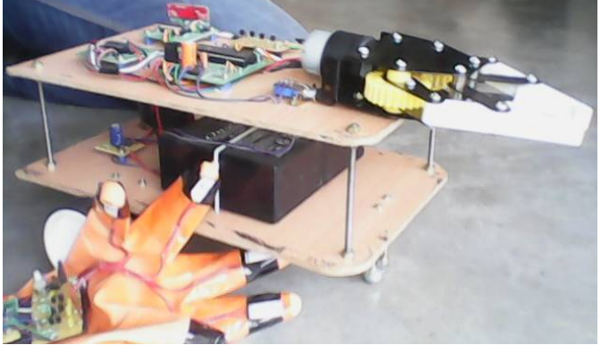
Figure-3Hardware kit for rover and arm control

Department of Electronics &Instrumentation Engineering, Adhiyamaan College of Engineering, Hosur, Tamilnadu, India