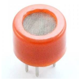
Fig.2: MQ-2 Gas sensor.

MQ-2 is a semiconductor type sensor used to detect the gas leakage. The sensor is made up of a sensitive material tin dioxide(SnO2). The response of this sensor is low in the clean air. Apart from its sensitivity to propane and butane, it also can sense combustible gases such as methane.