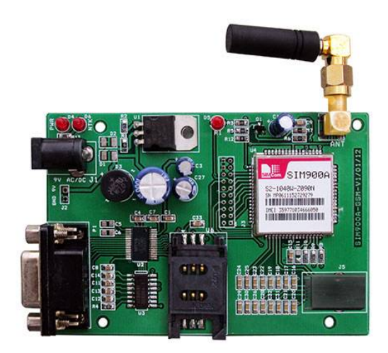
Fig.6: GSM modem.

Department of Electronics & Instrumentation Engineering, Adhiyamaan College of Engineering, Hosur, Tamilnadu, India