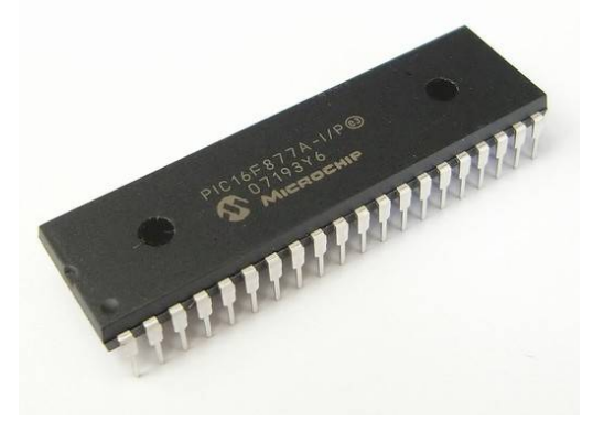
Fig.5: PIC16F877A Microcontroller.

PIC16F877A microcontroller is a device with 5 ports and an EEPROM of 256 bytes. The device is based on universal receiver and transmitter concept (USART). The PIC microcontroller has a high performance CPU. All the instructions are based on a single cycle, whereas the program branches are based on a double cycle. There are totally 40 pins. It has an operating speed of 200MHz of clock input and an instruction cycle of 200nS.