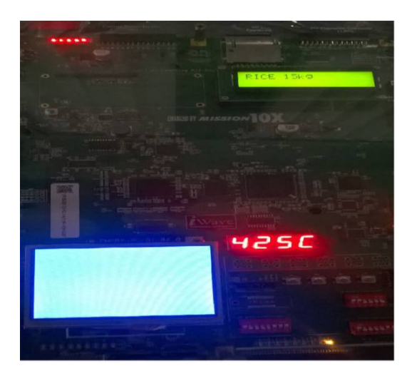
Fig.5 Output for above poverty line