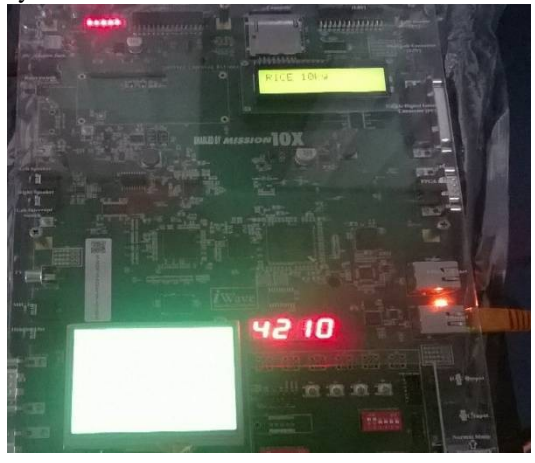
Fig.4 Output for below poverty line

Using Eclipse and UTLP kit simulation is done for two conditions. People are divided into two category as below poverty line and above poverty line.