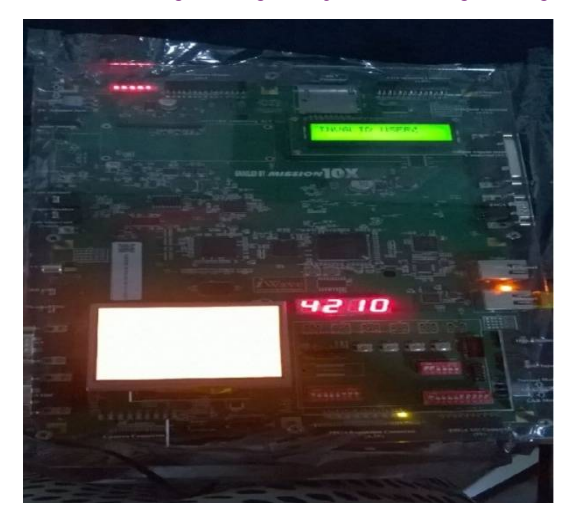
Fig.6 Output for invalid user

Department of Electronics & Instrumentation Engineering, Adhiyamaan College of Engineering, Hosur, Tamilnadu, India