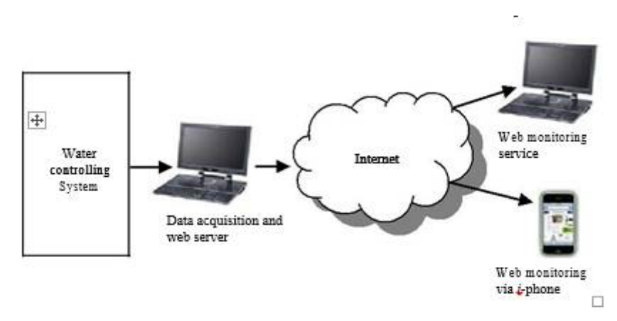
Figure 3: Water level monitoring network

Department of Electronics &Instrumentation Engineering, Adhiyamaan College of Engineering, Hosur, Tamilnadu, India described graphically in Fig. 3.We would like to partition this whole proposed wireless network in the following manner.