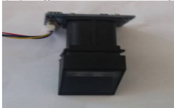
Figure. 2.1 Finger Print Module

A firmware made in C tongue is Customized into the microprocessor`s code memory range. The firmware control`s the working of the entire hardware part. Regularly the microcontrollers and the processor execute their own headings which are in machine code.in early days the applications were created in low level registering build.