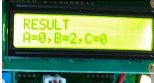
Figure 2.3 Result after voting