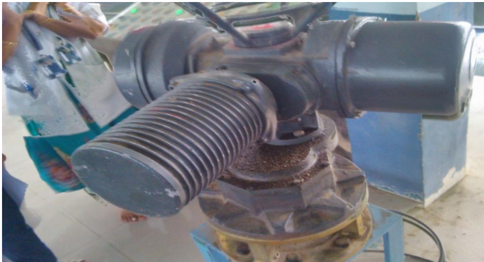
Fig. 6 Marsh electric actuator

The electric actuator we are using is manufactured by the Marsh. Fig. 5 shows Marsh electric actuator.