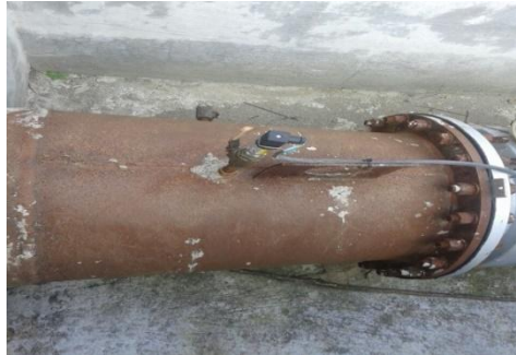
Fig.3. Siemens pressure transmitter

The pressure transmitter used in DP cell manufactured by the SIEMENS. This DP cell works on the principle of the pressure difference on both side of transmitter and thus the pressure of incoming flow is measured. Fig. 3 shows the Siemens pressure transmitter