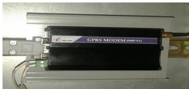
Fig.5. GPRS modem

General Packet Radio Service (GPRS) system is communication medium used to transfer the data to the operator station which is SCADA room where all the data is collected ,gathered and displayed on the screen. In GPRS, the data is in the form of packets, which is usually a 2.5G. Fig. 5 shows the GPRS modem.