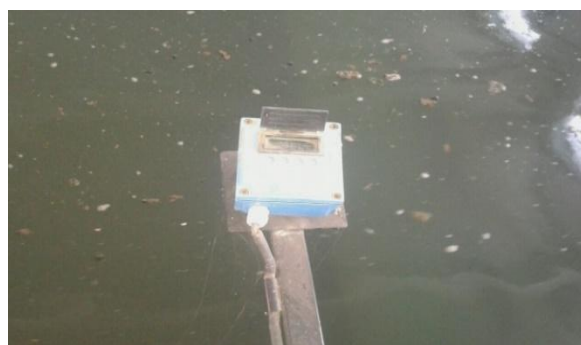
Fig. 2 Ultrasonic level transmitter

Ultrasonic level transmitter is shown in Fig. 2 which is used manufactured by the Forbes Marshall. In this, ultrasonic waves are transmitted and received and used to measure the level of the water. The level of the water in elevated service reservoir is also displayed on the SCADA.