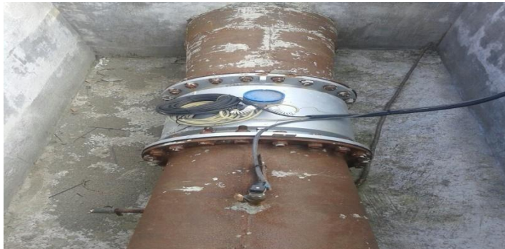
Fig.4. Electromagnetic flow meter

Electromagnetic flow meter manufactured by the Khrono Marshall is used to measure the flow of incoming water which is shown in Fig.4. According to the given set point of the flow will be compared with the flow measured with the transmitter .This will be also displayed on SCADA screen.