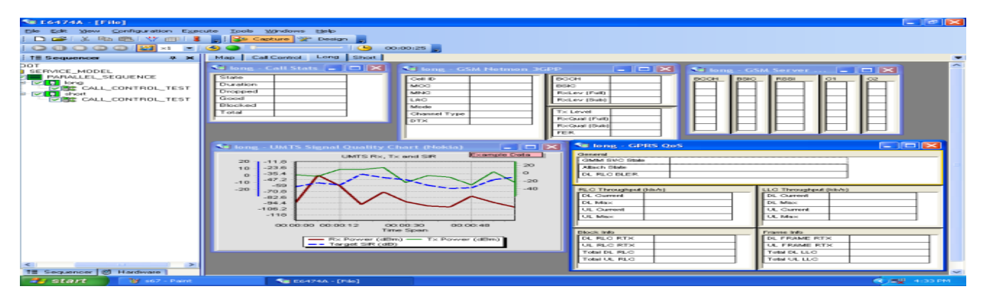
Fig.4Receiver Strength of the Long Call

And depending upon the different environment (areas), there may be complaint on poor quality, call disconnection etc. for which we have to go for the analysis of data. And the following Data Collection is possible in the drive tests which are essential for network development