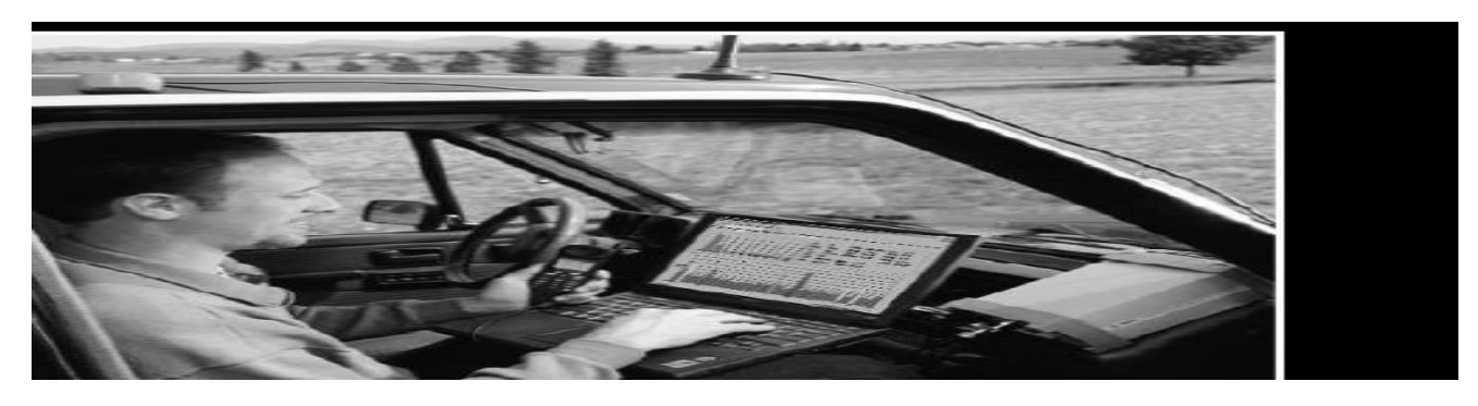
Fig.3 Photo Shot for Path Traces Study during the Driving

Before taking drive test the entire geographical coverage area is divided into three groups as Primary, Secondary and Miscellaneous routes as follows.