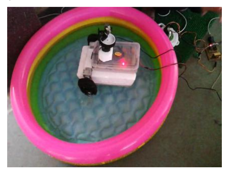
Fig 4.Testing of robot in water

In fig 4 the testing of robot in water is shown. We tested the proposed sytem in water, the robot moves according to the commands given from the transmitter side i.e. from laptop. Also the live footage is recorded by camera and the position of the ship is given by GPS.