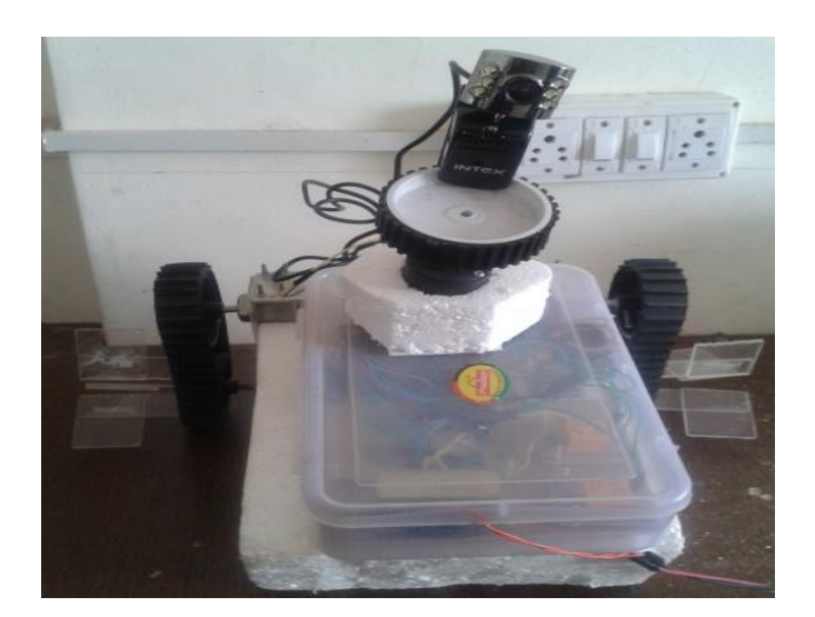
Fig 3.Design model of a proposed system

TTL signal by using converting circuit. L293d is a dual H-Bridge motor driver, so with one IC interface two DC motors can be interfaced. These motors can be controlled in both clockwise and counter clockwise-direction.