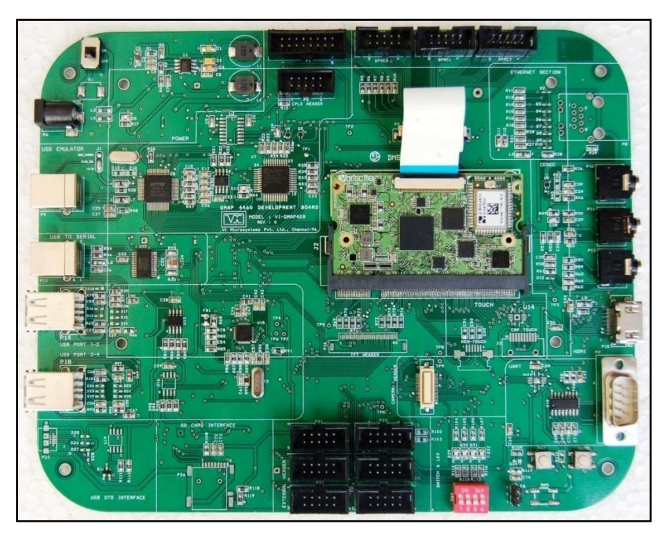
Fig 2: OMAP4460 Embedded board

(An ISO 3297: 2007 Certified Organization) Vol. 4, Issue 3, March 2015