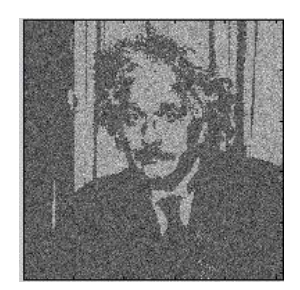
Figure 2: Noisy Input image

This section discusses the experimental results obtained from the proposed algorithm. All the implementation and evaluation work has been carried out in MATLAB 2013. The proposed algorithm is currently applied on an gray scale image with a resolution of 256 x 256 pixels. But can be applied to all sort of medical images such as Ultrasound (US), CT and MRI images affected from speckle noise. The performance measurement was done by calculating some image quality assurance parameters. As mentioned earlier, the proposed method involves few pre-processing steps once the input image is loaded. Then, the image is fed to some filtering techniques and output of each of these filters work as the input for the hybrid technique for fusion of images. Finally we get the fused denoised image with better quality.