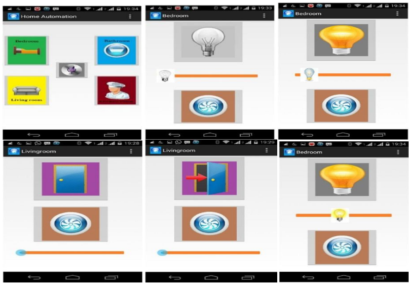
Fig 6. Screenshots of Android app

In Android the Reuse of other application Components is a concept Known as Task. An android application can access other components to achieve the task. For example, a component from of your application you can trigger another component in the system of Android, which manages photos, even if this component is not part of your android application. In this, you select a photo and return to your application to use the selected photo. Such a flow of events in the following graphic