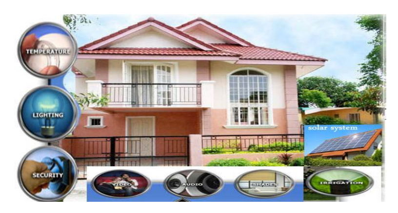
1. Fig: Home Appliances

Cybernation of Home is a term used to describe the working together of all household appliances and amenities, such as centrally-controlled Liquid Crystal Display can have the capability to control everything from security systems, air conditioning, heating, video systems, audio systems lighting and kitchen appliances. A diagram of cybernation of home system is shown below