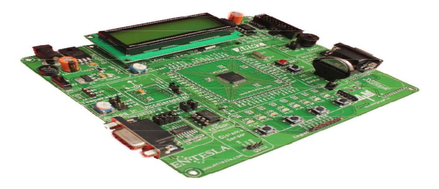
Fig 5.LPC 2148 Micro Controller

The LPC2148 microcontrollers is based on a 32-bit ARM7TDMI-S CPU with real-time emulation and embedded trace support, it combine microcontrollers with embedded high-speed flash memory ranging from 32 kB to 512 kB. A 128-bit memory interface and unique accelerator architecture enable 32-bit code execution at the maximum clock rate. For critical code size, the alternative 16-bit Thumb mode reduces code by more than 30% with minimal performance penalty. Due to their size and low power consumption, LPC2141/44/42/46/48 is ideal for applications where miniaturization is a key requirement like point-of-sale and access control. Serial communications interfaces ranging from a USB 2.0 Full-speed device, multiple SPI, UARTs, SSP to I2C-bus and on-chip SRAM of 8 kB up to 40 kB. These devices are very well suited for communication gateways, soft modems, protocol converters, voice recognition, low end imaging, providing both high processing power and large buffer size. Various 32-bit timers, single or dual 10-bit DACs, 10-bit ADC, PWM channels and 45 fast GPIO lines with up to nine edge or level sensitive external interrupt pins make these microcontrollers suitable for industrial control and medical systems.