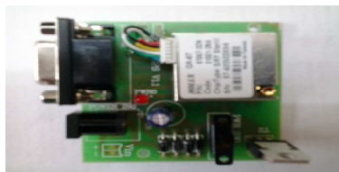
Fig.2 GPS receiver unit

E) GPS unit: The GPS receiver provides high position, velocity and time accuracy performances as well a high sensitivity and tracking capabilities. A GPS tracker essentially contains GPS module to receive the GPS signal and calculate the coordinates. For data loggers it contains large memory to store the coordinates, data pushers additionally contains the GSM/GPRS modem to transmit this information to a central computer either via SMS or via GPRS in form of IP packets.