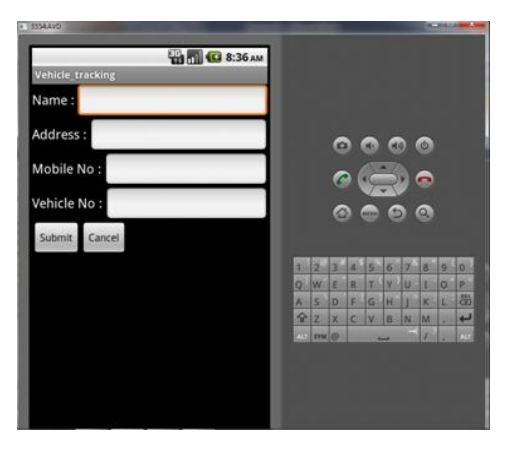
Fig. 3(b): Registration Form

By selecting particular option, corresponding service will be provided.