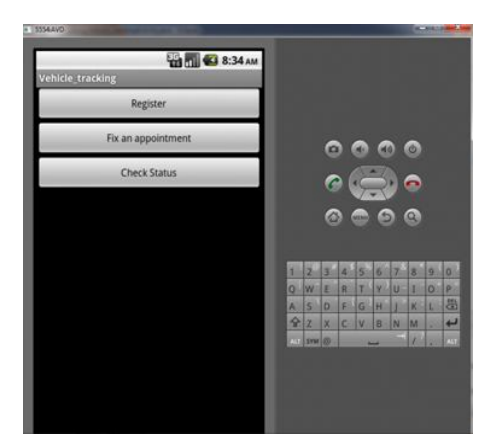
Fig. 3(a): List of activities.

Fig 3(a) Application will contain the main page having options for registration, appointment fixing and tracking. Copyright to IJAREEIE www.ijareeie.com