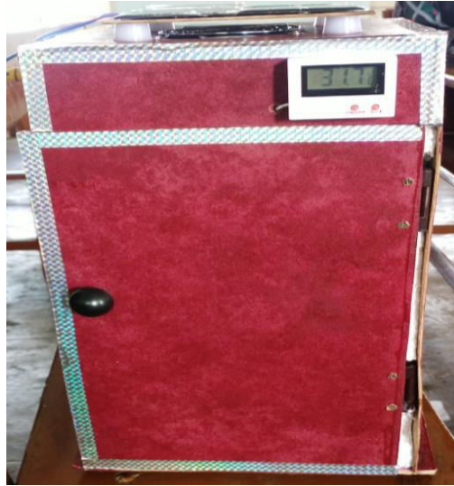
Fig 2. Photograph of Machine