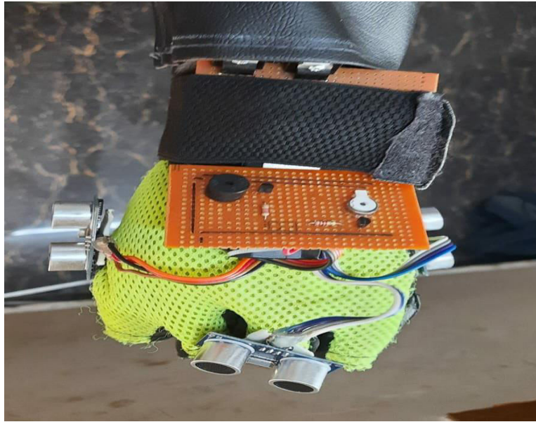
Fig 2 Prototype model