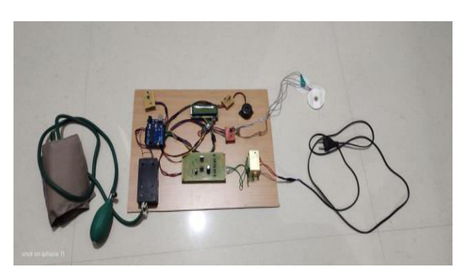
Figure: 4 Snap shoot of hardware implementation

You can tinker with your UNO without worrying too much about doing something wrong, worst case scenario you can replace the chip for a few dollars and start over again. "Uno" means one in Italian and was chosen to mark the release of Arduino Software (IDE) 1.0. The Uno board and version 1.0 of Arduino Software (IDE) were the reference versions of Arduino, now evolved to newer releases. The Uno board is the first in a series of USB Arduino boards, and the reference model for the Arduino platform; for an extensive list of current, past, or outdated boards see the Arduino index of boards.