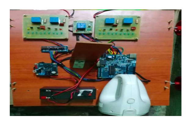
Figure: 1. Hardware Implementation

At designing an autonomous robotic system that helps people to maintain their highway cleaned during their rush times and also help the highways neat and clean. This can be achieved with a combination of a micro-controller based system, a hardware cleaning module and solar system.