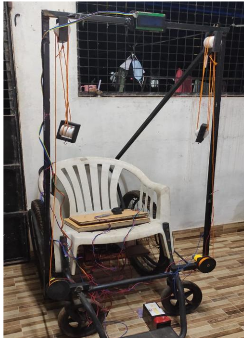
Fig.4 Therapy chair