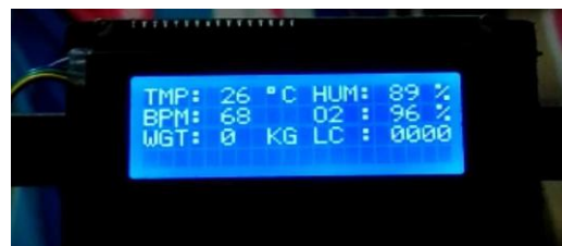
Fig.3 Display of the therapy chair

In the trial run of the system, the dc motors in the therapy system lifts the weight up to 10 kg in each side. In the vital monitoring system that consists of various sensor . The pulse oximeter senses heart beats of the patients and BPM value and oxygen level are detected. Similarly temperature sensors, senses the body temperature and measured the temperature level. Also the flow meter installed and it determined the lungs capacity of the users. The weight of the the users is obtained by installing the load cell arrangement in the system. All this measured values are displayed on the LCD display that is attached to the chair. An alerting system installed, it sends message to the caretakers in the emergency situation. Here the fig.3 shows the display of the system, which shows the measured vitals value. In fig.4 shows final implemented therapy chair.