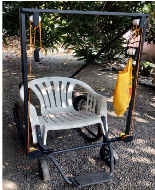
Fig.2 Wheelchair frame

The therapy unit consists of two parts; the first one is used for upward and downward movement of legs and hands. It consists of controlled weight loading with help of pulley system and DC motor set. DC motor set is fixed on the chair with pulley connect to it through belt. With the help of the DC motor the vertical movement of hand and legs can be done. The second part of the therapy unit is the vibration part, the vibration pad provide vibration to the foot. Fig.2 shows the frame of wheelchair.