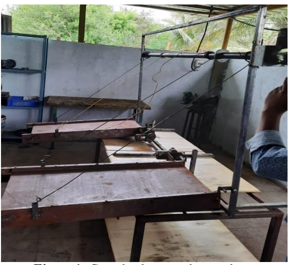
Figure 1: Completely opened ramp door.