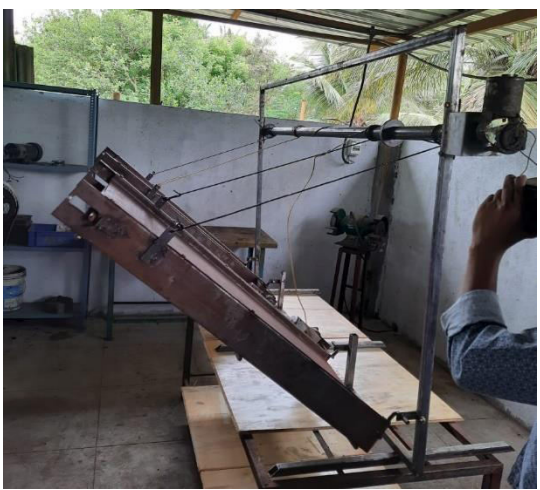
Figure 2: Closing of door