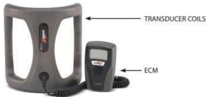
Fig.3 OL1000 SC size 2.

Orthologic 1000 single coil bone growth stimulator: The OL1000 SC is a portable, battery powered, microprocessor controlled, bone growth stimulator. The device is worn by the patient for 30 minutes a day as well provides local electric treatment with non-invasive splits. The device generates the lowest energy consists of static fields. The device has a pressure button that starts treatment with an audible voice input. Liquid crystal display (LCD) used to display device status, e.g., medical record, daily treatment time count down.