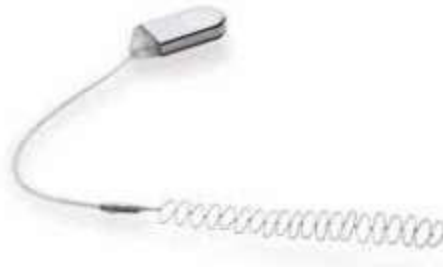
Fig.2 OsteoGen bone growth stimulator

number of points to identify contacts for the cathode travels to these sensitive areas, thereby increasing the surface area of the membrane bones.