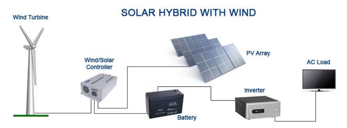
FIG 3: SCHEMETIC DAIGRAM OF WIND SOLAR GENERATION

Green energy like solar energy, vibration energy, wind energy can be converted into electricity and then we can use this electricity in many applications on highways such as for charging the vehicles using these energies, for lighting, and for monitoring the condition of the road etc. Vibration produced by vehicles can be converted into electricity and further can be used for charging the electric cars or for lightning the street lights, or can be stored in any charge storing devices. There is abundant amount of free space available between lanes and in both right and left side of lanes, which can be utilized by placing windmills and solar plates. Solar plates can also be mounted on the top surface of cars and electricity generated by them can be utilized for operating music system, air conditioner, or for any other purpose in cars. It can also be stored in any charge storing device for future use. There are streets having very less traffic in night and street lights are lightning empty roads for entire night i.e. completely wastage of electricity . So by using sensors and led, lights can be turned on only when any vehicles or passenger passes by road otherwise turned off. Fuels consumed by vehicles like petrol, diesel etc. produces harmful gases so its substitute like hydrogen cars, electric cars, or any other source of green energy must be used.