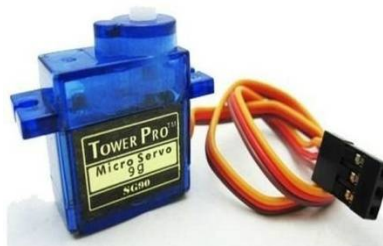
Fig 6. Servo Motor

A servo motor is an electrical device which can push or rotate an object with great precision. It is just made up of simple motor which run through servo mechanism. All motors have three wires coming out of them. Out of which two will be used for Supply (positive and negative) and one will be used for the signal that is to be sent from the MCU. Servo motor is controlled by PWM (Pulse with Modulation) which is provided by the control wires. There is a minimum pulse, a maximum pulse and a repetition rate. Servo motor can turn 90 degree from either direction from its neutral position. The servo motor expects to see a pulse every 20 milliseconds (ms) and the length of the pulse will determine how far the motor turns.