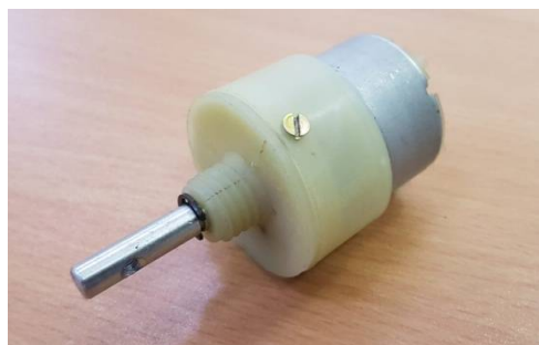
Fig 4. DC motor

We have used two geared motors at the rear of the line follower robot. A DC motor is any of a class of rotary electrical machines that converts direct current electrical energy into mechanical energy. These motors provide more torque than normal motors and can be used for carrying some load as well.