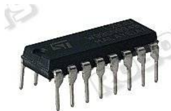
Fig 3. Motor Driver IC

L293D is a typical Motor driver or Motor Driver IC used in this project which allows DC motor to drive on either direction. L293D is a dual H-bridge 16-pin IC which can control a set of two DC motors simultaneously in any direction. Motor drivers act as current amplifiers since they take a low-current control signal and provide a higher-current signal. This higher current signal is used to drive the motors. In this system, it receives signals from Arduino based on the information from the IR Sensors. The power supply to the motors must be given from the motor driver IC.