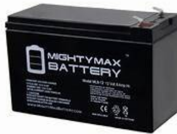
Fig7. Power supply