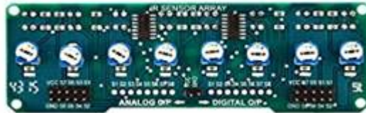
Fig5 IR Sensor

This sensor module has 8 IR LED/phototransistor pairs mounted on a 0.375" pitch, making it a great detector for a line-following robot. Pairs of LEDs are arranged in series to halve current consumption, and a MOSFET allows the LEDs to be turned off for additional sensing or power-saving options. Each sensor provides a separate digital I/O-measurable output. The IR Rx emits IR radiation and the Rx helps in receiving the waves. A line follower robot, or a LFR in short, is a simple autonomous robot that optically tracks a line made on the surface of the floor. That means you have an arbitrary line drawn on the floor and the robot tracks it by moving right along it! The line is sensed using a piece of hardware called a line sensor.