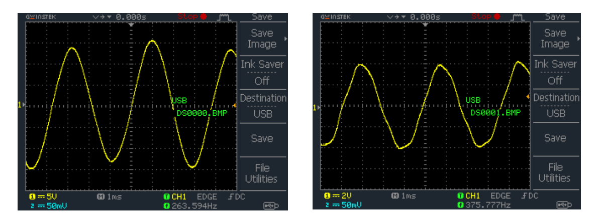
FIGURE B: PEAK VOLTAGE VOLTAGE OF STARTING COIL VS PEAK VOLTAGE OF LIGHTING COIL

This system would measure several parameters such as wheel speed, coils status value, electrical components status value and help us in comparing with its standard values. This system, thus make the possibility of managing real world analysis. The details of a random testing conducted are as follows: