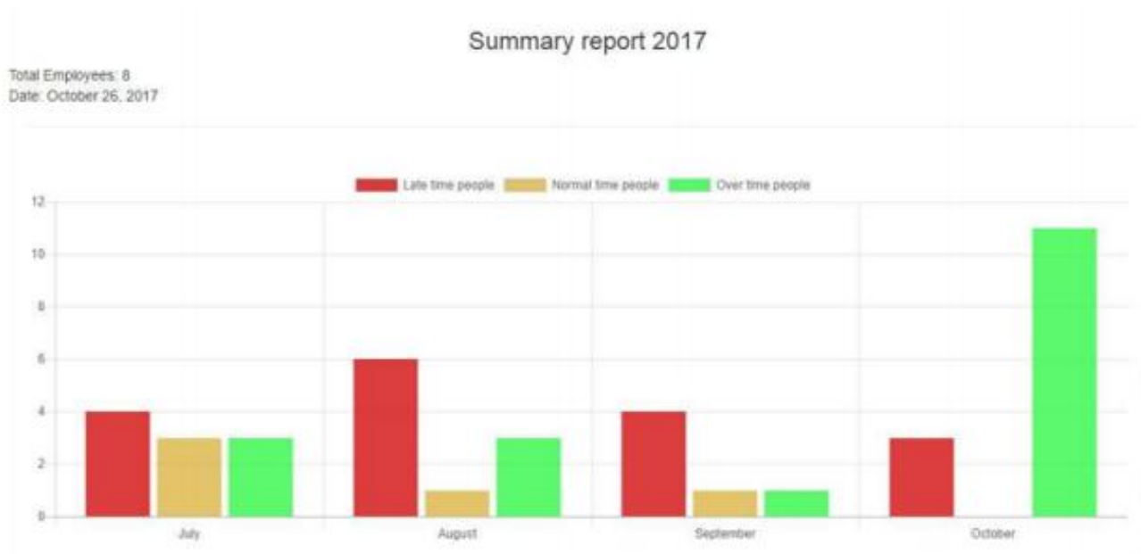
Figure 4 result of proposed system