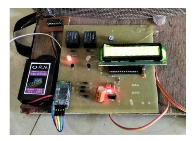
Fig. 2 Hardware setup

Figure 2 shows the hardware setup of the project. The microcontroller ATMEGA328 is interfaced with Bluetooth module HC05 for serial communication to select the type of crop through a remote device. Based on received data, the microcontroller schedules the irrigation according to control algorithm and generates HIGH or LOW signal to operate relay which switches the water pump ON/OFF.