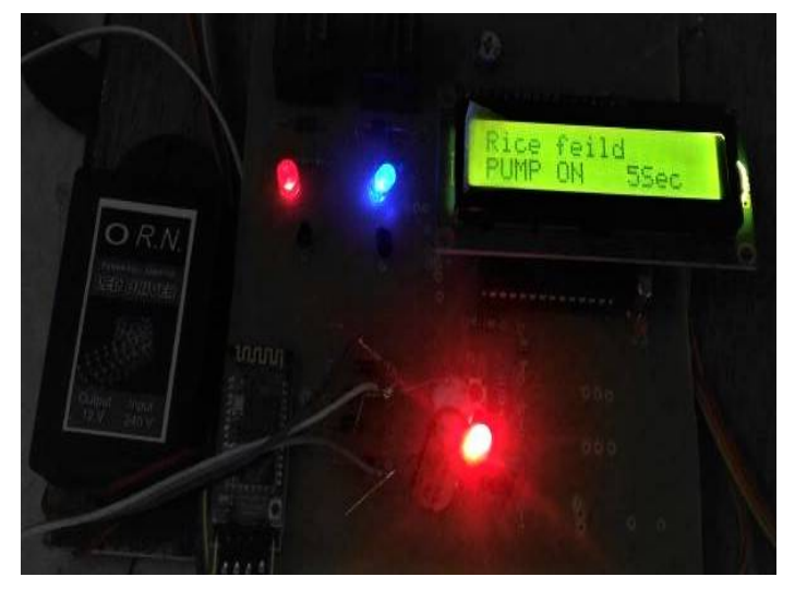
Fig .3 LCD Displaying various status

(An ISO 3297: 2007 Certified Organization) Website: <u>www.ijareeie.com</u> Vol. 6, Issue 4, April 2017