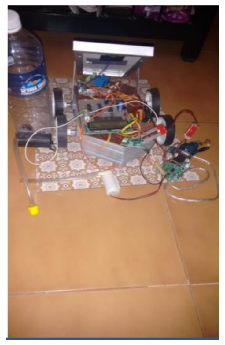
Fig -2: Working model

Agricultural Robotic Machine project was implemented and tested. Different types of sensors are used for sensing agricultural parameters. Solar panel is used for charging the battery.