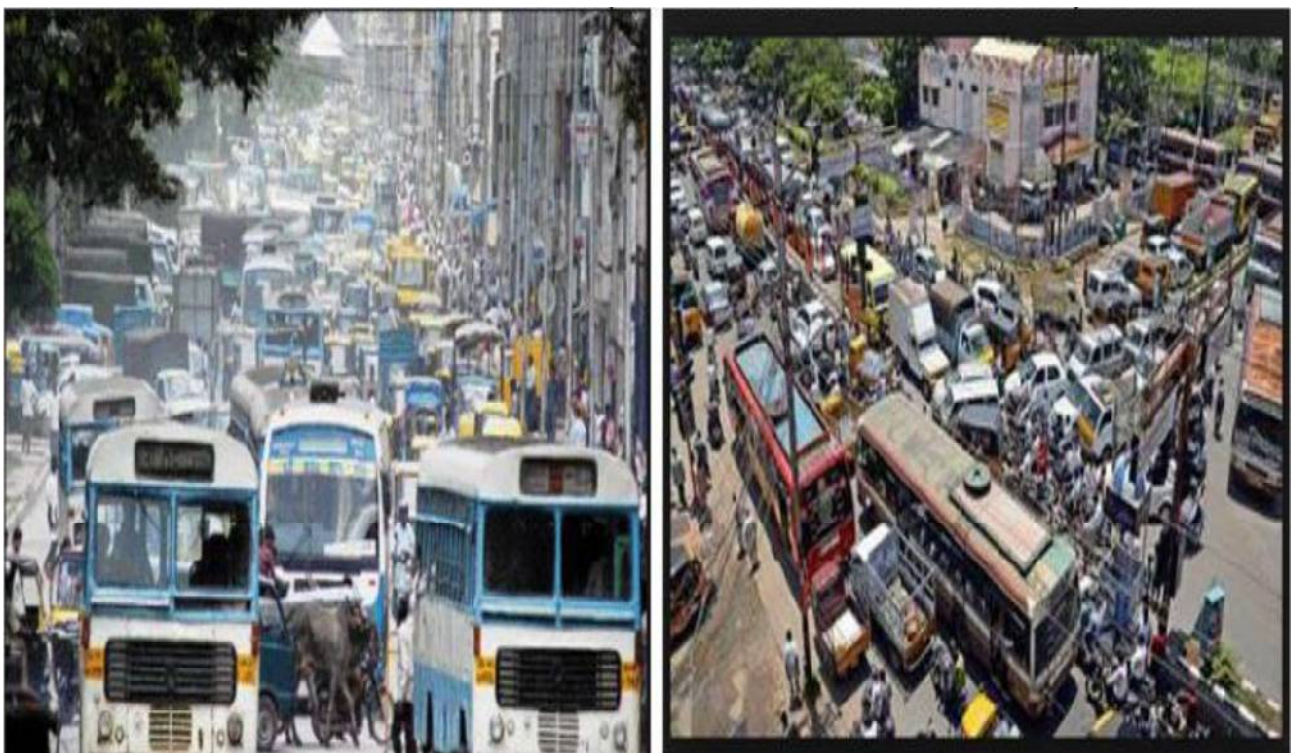
Figure1: over saturation

wave to the desired vehicle. A 'green wave' is the synchronization of the green phase of traffic signals. With a 'green wave' setup, a vehicle passing through a green signal will continue to receive green signals as it travels down the road. In addition to the green wave path, the system will track a stolen vehicle when it passes through a traffic light. Advantage of the system is that GPS inside the vehicle does not require additional power. The biggest disadvantage of green waves is that, when the wave is disturbed, the disturbance can cause traffic problems that can be exacerbated by the synchronization. In such cases, the queue of vehicles in a green wave grows in size until it becomes too large and some of the vehicles cannot reach the green lights in time and must stop. This is called over-saturation as shown in figure 1 [12],[13].