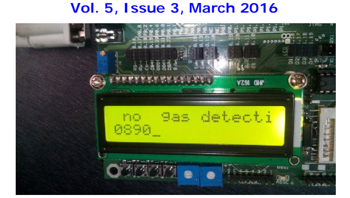
Fig. 2 displaying result on LCD

(An ISO 3297: 2007 Certified Organization)