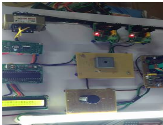
Fig 3 Hardware