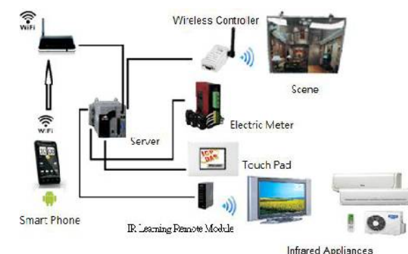
Figure 4. Devices controlled by the server in a smart lighting system.

As a server, XP-8000 takes charge of data access, and gets connected to a Touch Pad, a multimeter, an IR learning remote module, a wireless lighting controller, and many more through an RS-232 or an RS-485 interface such that a digit home is constructed. As illustrated in Figure 4, an IR learning remote module is wired to the server, an XP-8000, through an RS-232 interface, while the voltage/current readings on a multimeter is transmitted to the server by means of an RS-485 interface. A light module is instructed via a wireless controller connected to and by the server through the RS-232 interface, and the server is operated according to the command issued by a Touch Pad through WiFi connection.