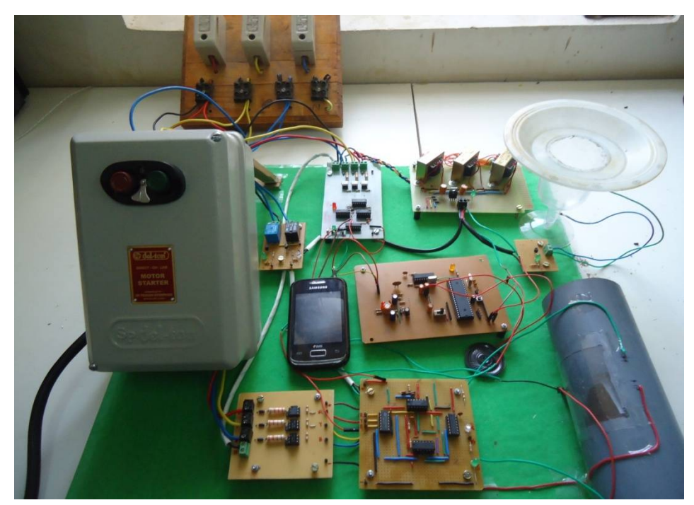
Figure-2 Experimental setup

The figure below shows the experimental setup of Microcontroller based three phase motor controller using GSM with voice acknowledgement system for irrigation system.