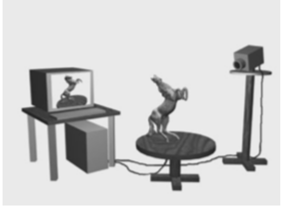
Figure 2. System for Image Acquisition

A modelling system for generating a 3D Model using the Silhouette information was designed by Franco et al [15] under an environment which is completely controlled. The system which was designed for acquiring images around the object and to identify the camera parameters with respect to these views had a camera which was fixed on a rotatory table which is shown in the figure 2.