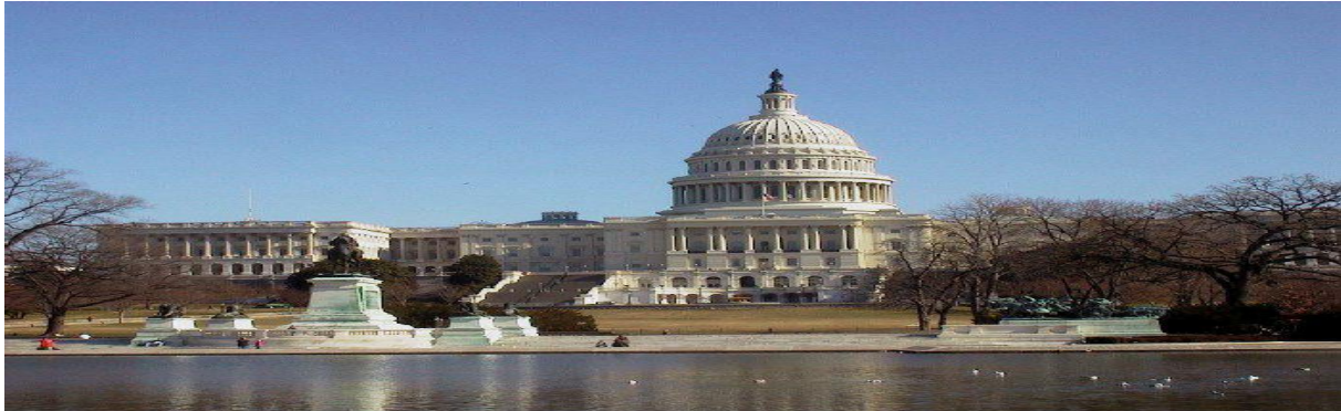
Fig 2. Example of Image Properties.

If we look at the image shown in Fig 2., the white color and the texture of the building are characteristic properties.