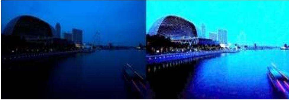
Fig 11: Bridge