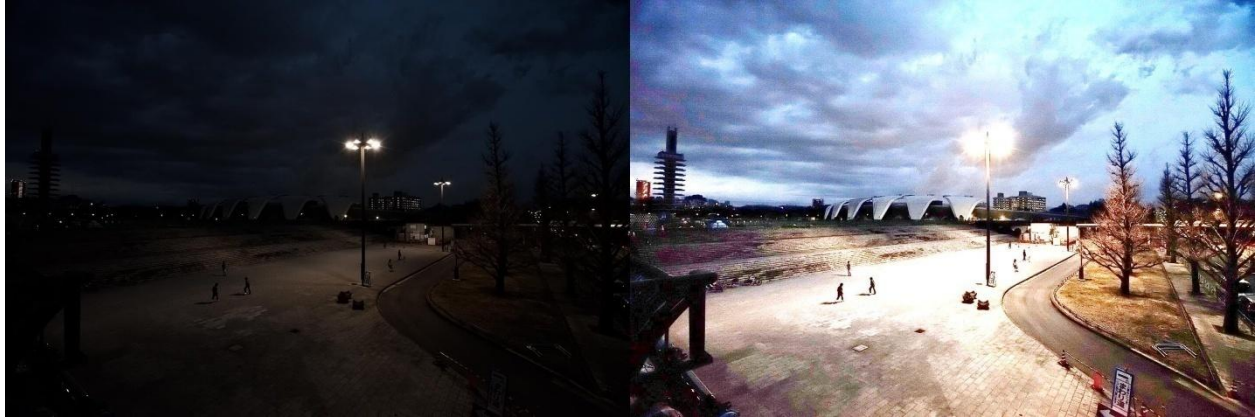
Fig 3: Street light