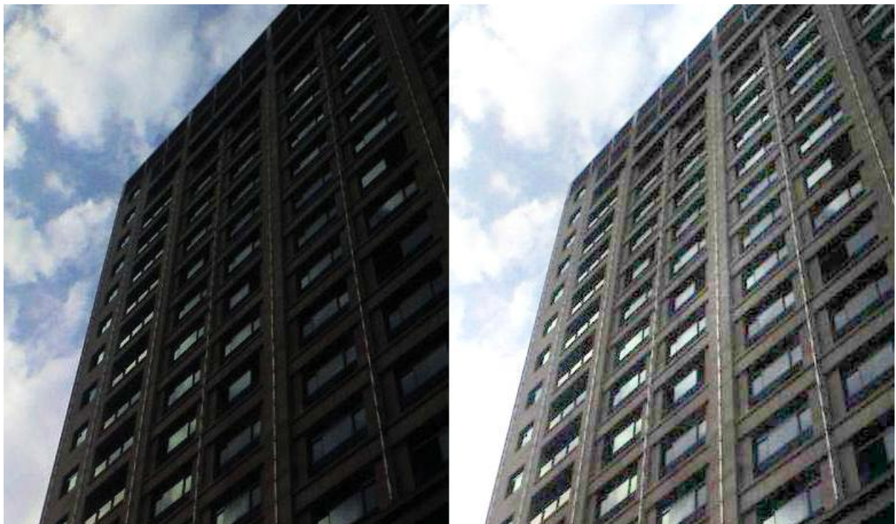
Fig 2: Building