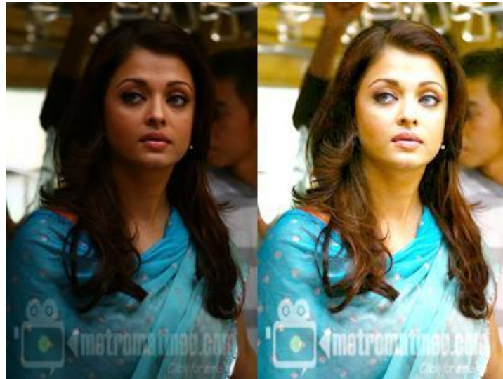
Fig 1: photo in a bus