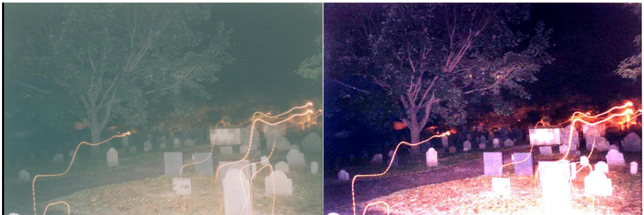
Fig 9: Image of decoration