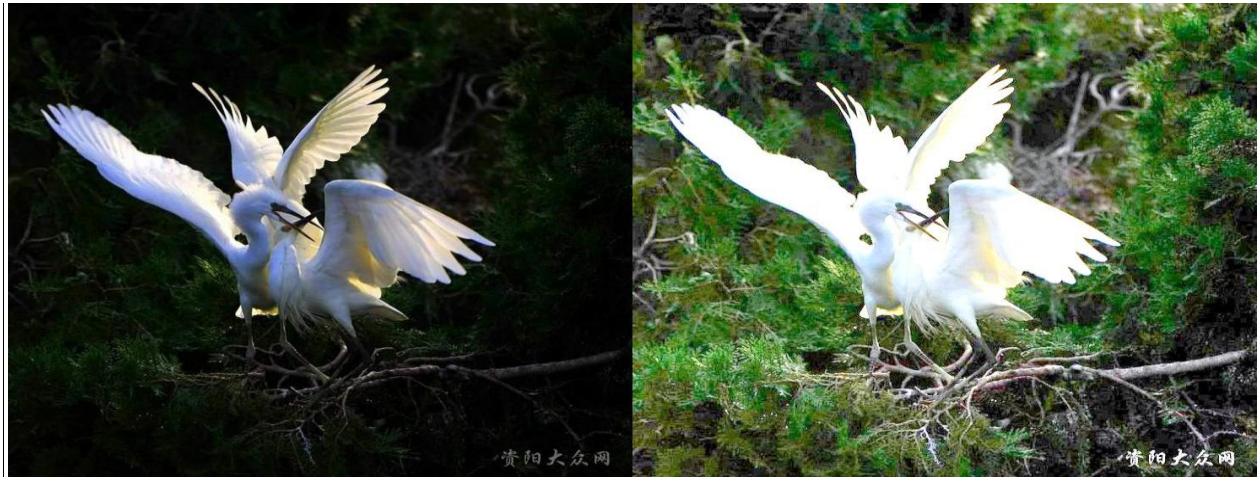
Fig 8: Birds in forest