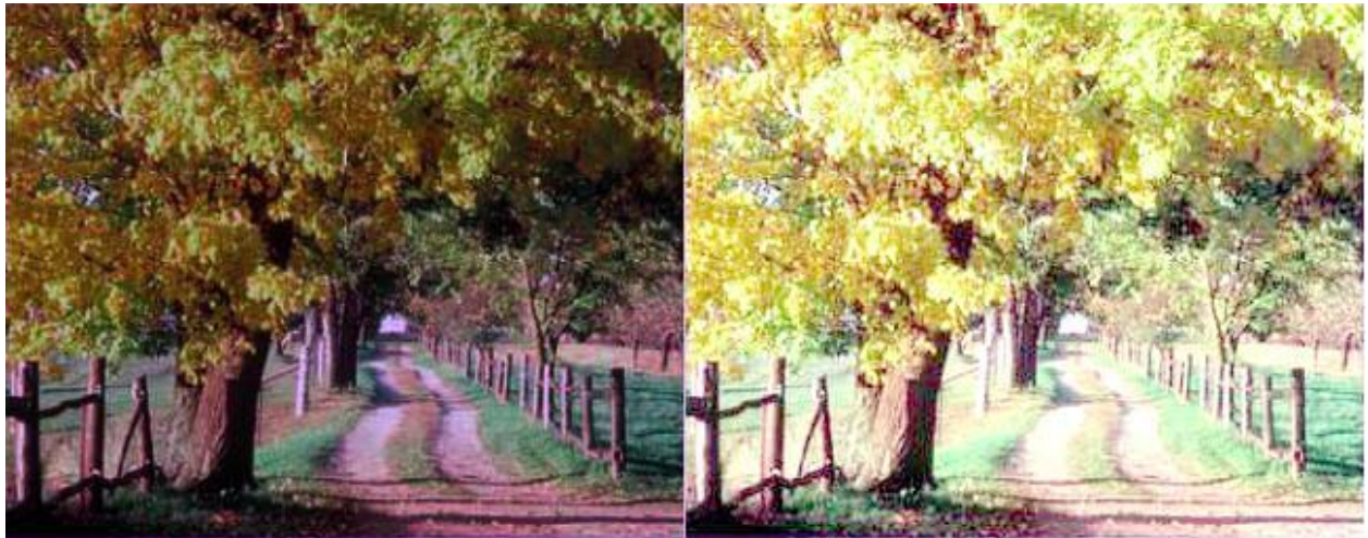
Fig 6: Tree