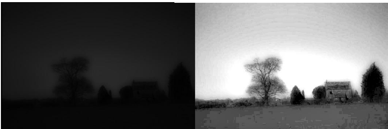
Fig 10: Scenary