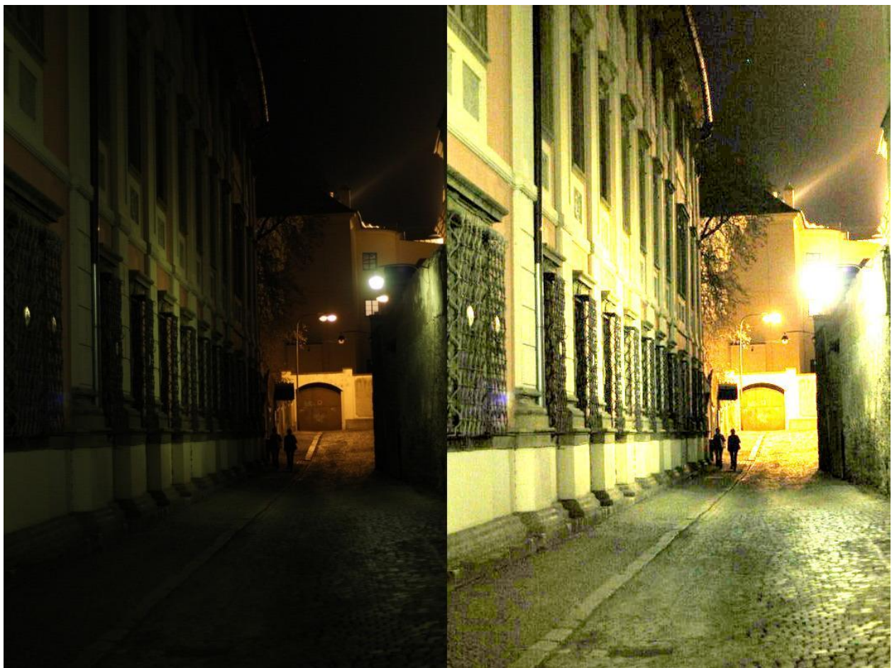
Fig 7: Dark street