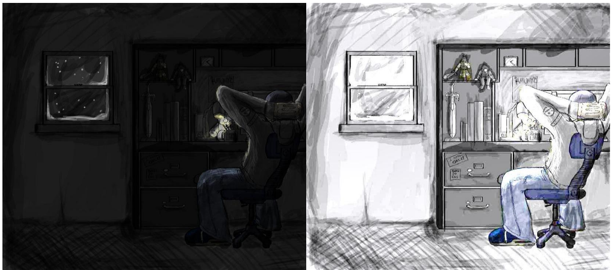
Fig 4: Person sitting on chair