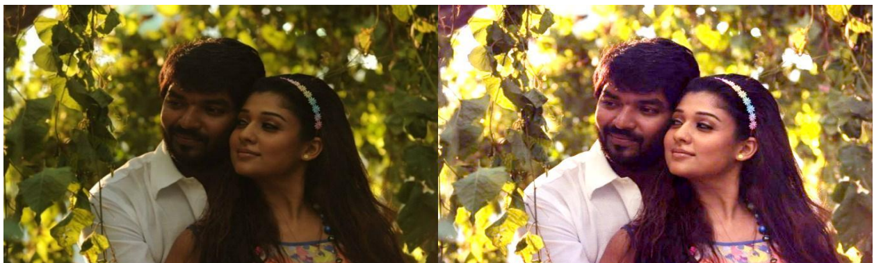
Fig 5: Scene from a movie